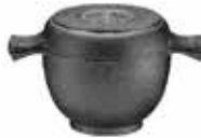
Mini Casserole, pan lid

3 0, 5.6 kg Art No. 0610-1 Design by Torkel Dahlstedt