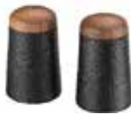
SHAKE, Salt & Pepper 8 cm, 0.9 kg Art No. 0076 Design by Carl & Carl