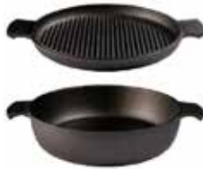
Casserole, grillpan lid

22.8 kg Art No. 0610WB Design by Torkel Dahlstedt