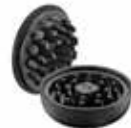
SPICE, Spice Mill Art No. 0077