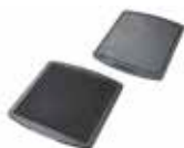
Grill & fry plate, turnable