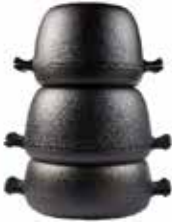
Grytstapel – 3 casseroles

A collection of various cast iron casseroles made by hand in Sweden. All casseroles are seasoned with locally produced canola oil and have precision turned bottoms. Lids are made of cast iron and can be used as freestanding frying, grill or omelette pans.