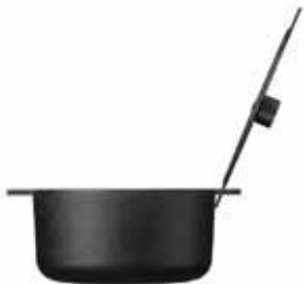
Casserole 5l with lid