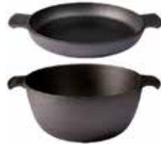
Casserole, frypan lid

27 cm, 6.2 kg Art No. 0610-3 Design by Torkel Dahlstedt