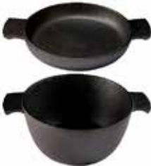
Casserole, omelette pan lid

4.5 l, 7.0 kg Art No. 0610-2 Design by Torkel Dahlstedt