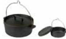
Dutch Oven, iron lid